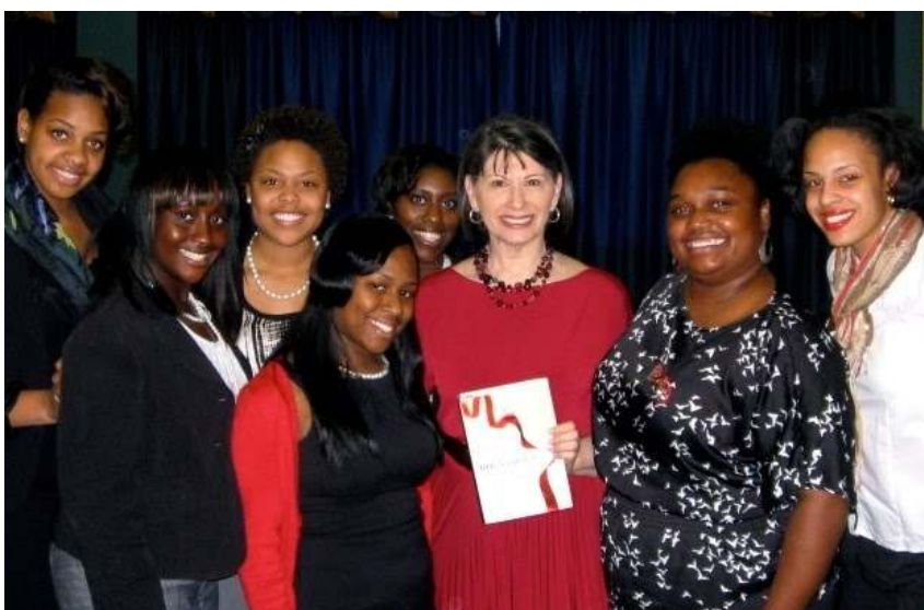
The Deltas turned out in powerful force at my No Excuses keynote at Old Dominion University.

are saying about my speeches and workshops? Download it here