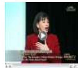
Gloria Feldt on Leadership at Tucson Book Festival

Click to watch highlights of "Women and Leadership" Speech.