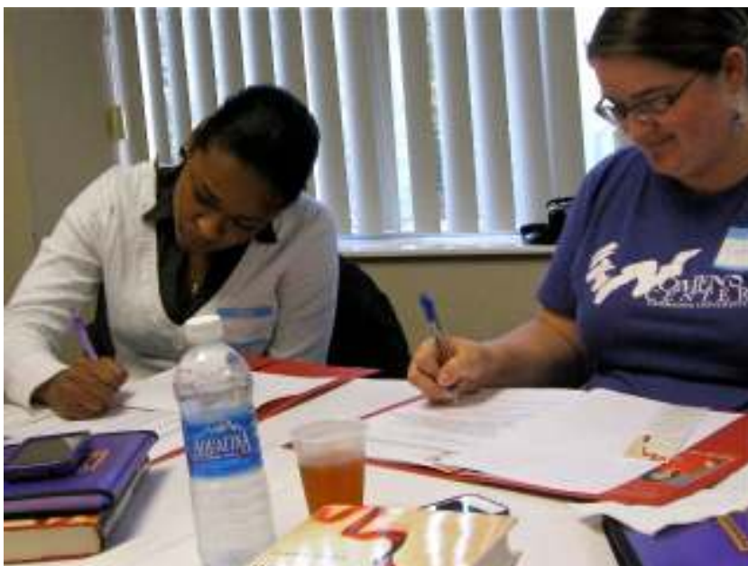
No Excuses Power Tool workshop participants "defining their terms" at Old Dominion University.

So many people who made my speaking experiences rock this fall. It is such a privilege to be able to share inspiration, wisdom, and practical leadership tools. Here are just a few photographic highlights.