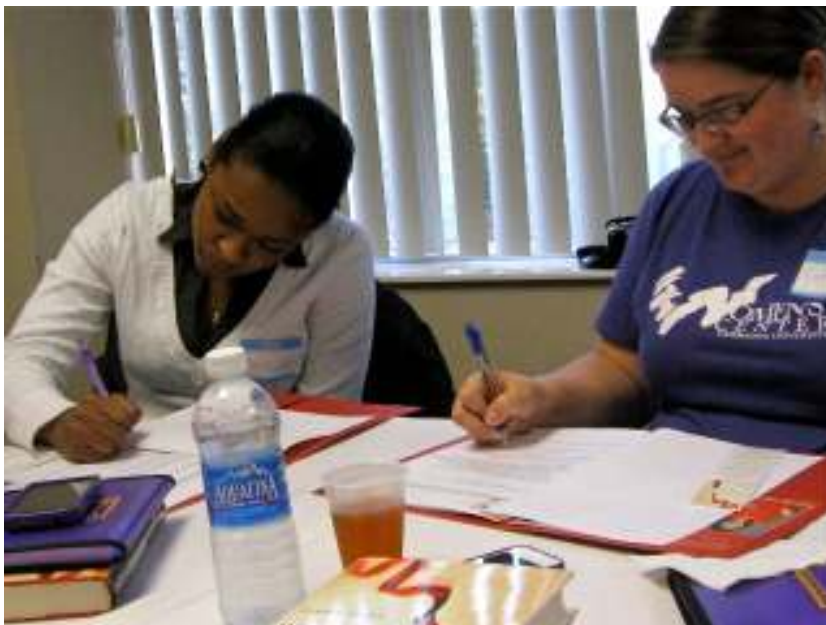
No Excuses Power Tool workshop participants "defining their terms" at Old Dominion University.

So many people who made my speaking experiences rock this fall. It is such a privilege to be able to share inspiration, wisdom, and practical leadership tools. Here are just a few photographic highlights.