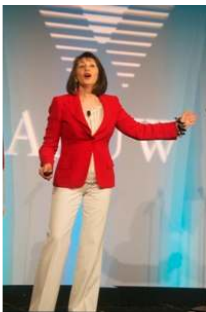
Keynoting the AAUW National Convention.

Definitions are important, as I noted about Forbes' Most Powerful Women's self-effacing definitions of their power in last week's Friday Round Up of news stories, a new feature on my 9 Ways blog . (Sometimes I don't get around to writing it till Saturday, but that's no problem because I just redefine Saturday as Friday.)